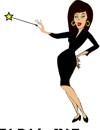
TA DA by KAT